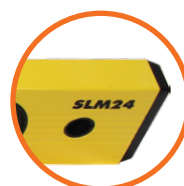
Protective end caps