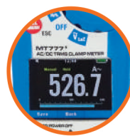
6000 Count Backlit TFT Colour Display