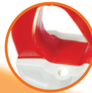
Meter includes flash light to light up area of test