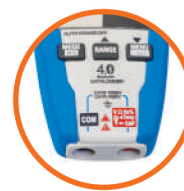
Rear entry of standard 4mm Test Lead Terminals