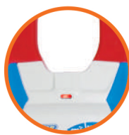
Red Light indicates detection of Non Contact Voltage (NCV)