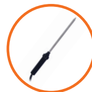
65mm Stainless Steel Sensor Probe