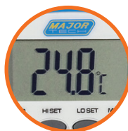
3" Digital LCD Display