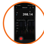
Transfer Live Readings to the Mobile App