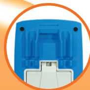
Integrated Test Lead Holder