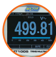
50 000 Count 320 x 240 TFT colour LCD display