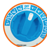
Easy to Read Functions