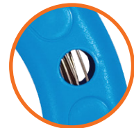
Windows to see the amount of draw-wire in the roll