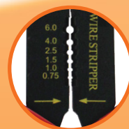
Strips Cables 0.75mm 2 - 6mm 2