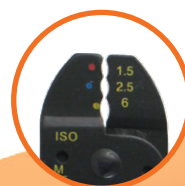
Crimps terminal sizes 1.5mm 2 to 6mm 2