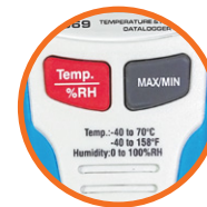
Selectable Measuring Time Intervals from 1 Second to 24 Hours