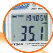
Large LCD Showing Current Readings of Max, Min, Time, Date, Temp & Humidity