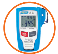
Lockable Wall Bracket