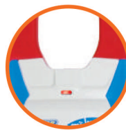
Red Light indicates detection of Non Contact Voltage (NCV)