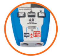
Rear entry of standard 4mm Test Lead Terminals