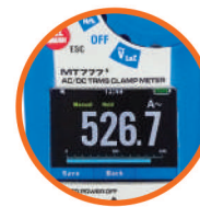
6000 Count Backlit TFT Colour Display