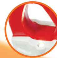
Meter includes flash light to light up area of test